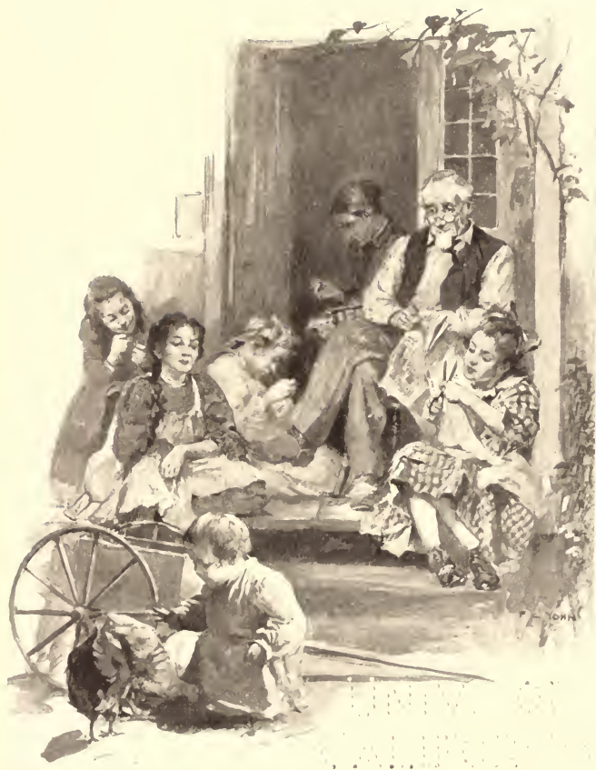
GREAT, THOUGH FRIENDLY, WAS THE RIVALRY BETWEEN THEM